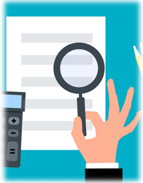
Analysis of Interlibrary Loan request