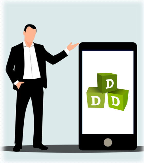
Uploading of public domain documents in the repository