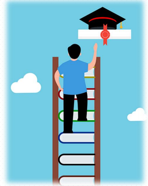
Digitization of PhD theses